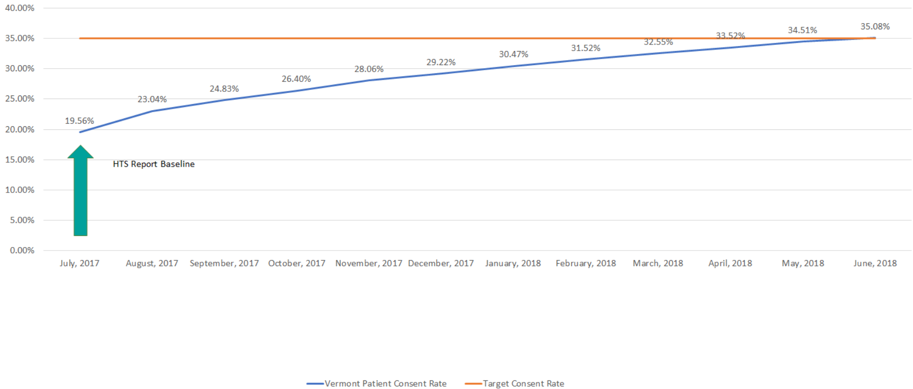
Percentage of Vermont Patients Who Have Provided Consent Target = 35%