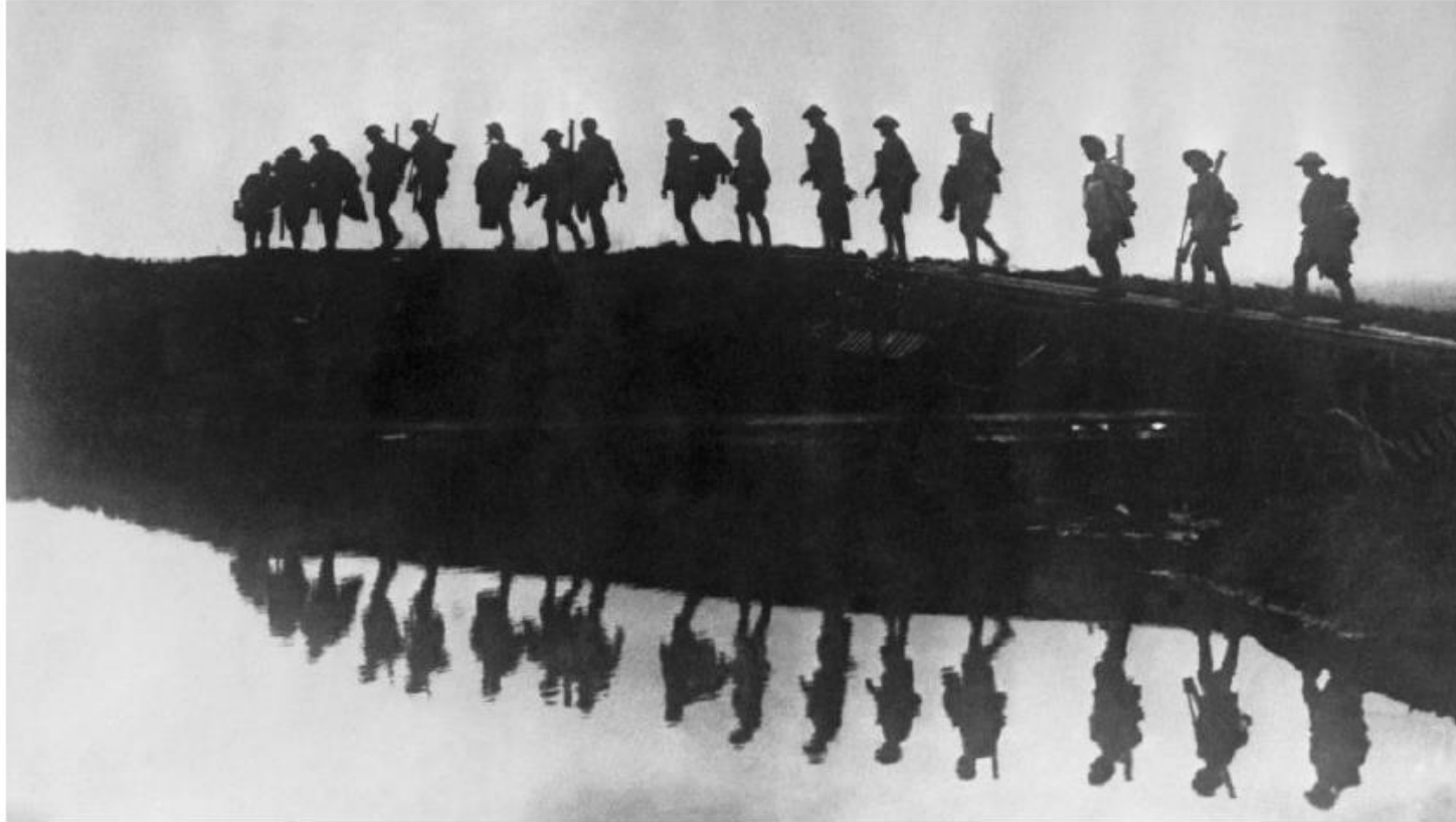
Supporting troops of the 1st Australian Division form a silhouette as they pass towards the front line in Belgium during the first World War.

Physicians on the front lines of health care today are sometimes described as going to battle. It's an apt metaphor. Physicians, like combat soldiers, often face a profound and unrecognized threat to their well-being: moral injury.